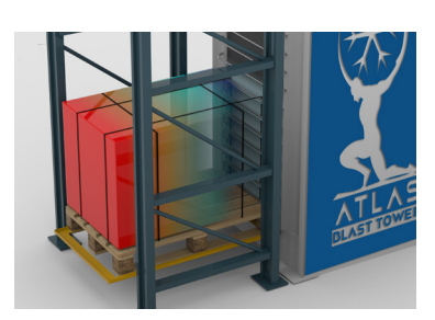
RACK POSITION DOORS OPEN WHEN PALLET IS LOADED