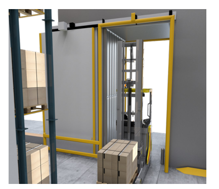
HCR DOORS DURING OPERATION

ATLAS combines patented technology developed by IRFS and our partners to produce an integrated blast freeze system. ATLAS pushes cooled air directly onto the product, rather than pulling it from the surrounding room. This significantly enhances freezing as colder air is placed exactly where it is required. ATLAS enables continuous operations through reduced batch sizes as each pallet position can begin cooling as soon as it is placed in position. ATLAS provides digital pallet level monitoring and uses a patent pending rack supported design that reduces facility construction costs.