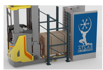
VARYING PALLET SIZES